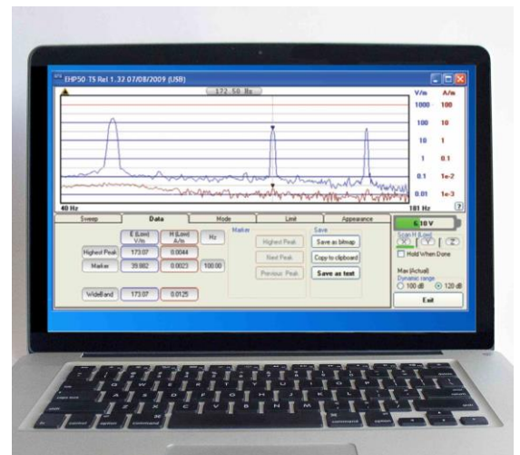
Measurement controlled by PC with EHP50-TS