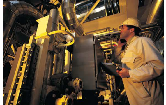
Fields occur when electrical energy is generated

International standardization bodies and organizations such as WHO, ICNIRP, IEC, IEEE, and CENELEC, as well as national authorities have for many years been working on establishing and updating the immission protection limit values or on product standards. There is no dispute about the short-term effects of high frequency and low frequency fields. Limits for the general public and in the workplace are in force practically everywhere around the world. However, such limit values on their own are not enough to protect people. They must also be verified by calibrated measurement to make certain.