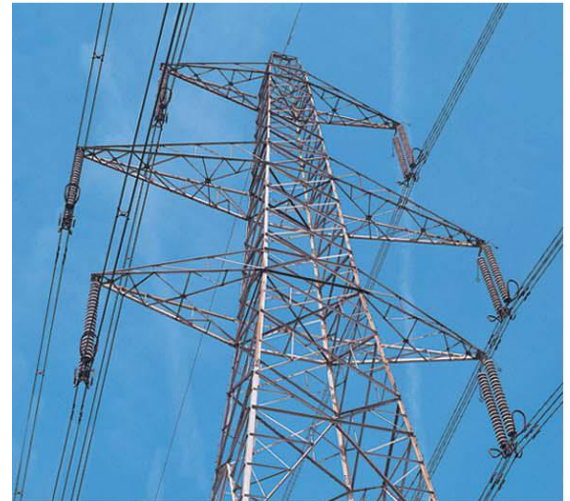
... where electrical energy is distributed