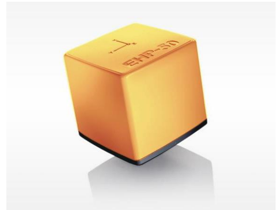
The compact case of the EHP-50F contains all the technology for measuring E fields and H(B) fields

The EHP-50F uses a Weighted Peak evaluation with convolution in the time domain that conforms to ICNIRP 2010 and IEC 61786-2. The measurement covers the entire frequency range from 1 Hz to 400 kHz. A graph shows the measured value versus time.